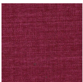
CAPRI PG 1 095 CORAL