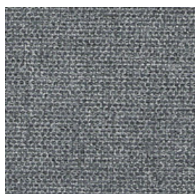
BARI PG 1 167 ZINK