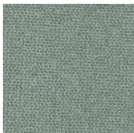
BARI PG 1 050 MINT