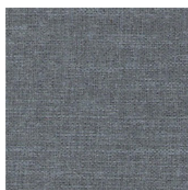
CAPRI PG 1 167 ZINK