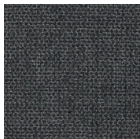
BARI PG 1 065 GREY