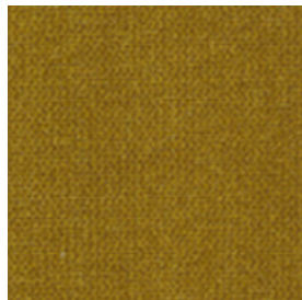
BARI PG 1 006 MUSTARD