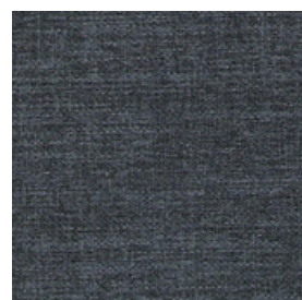
CAPRI PG 1 089 DARKGREY