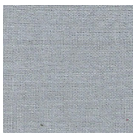
CAPRI PG 1 060 LIGHTGREY