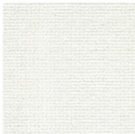
BARI PG 1 0002 CREAM