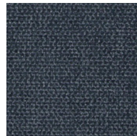
BARI PG 1 048 DARKBLUE