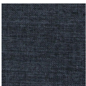
CAPRI PG 1 048 DARKBLUE