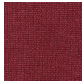
BARI PG 1 141 SCARLET