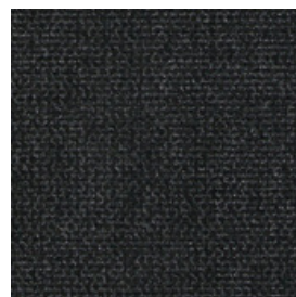
BARI PG 1 067 ANTHRAZIT