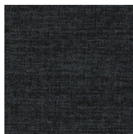
CAPRI PG 1 079 CHARCOAL