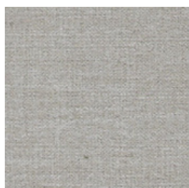
CAPRI PG 1 001 NEUTRAL