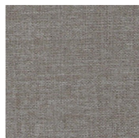
CAPRI PG 1 010 LIVER